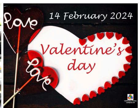
Valentine's Day 14.2.24