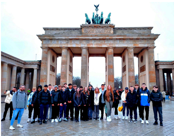
Berlin residential trip 13 - 16 February 2024