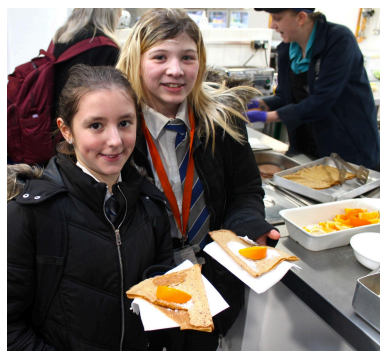
Pancake Day 13.2.24