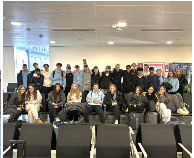
Ski USA residential trip 14 - 22 February 2024