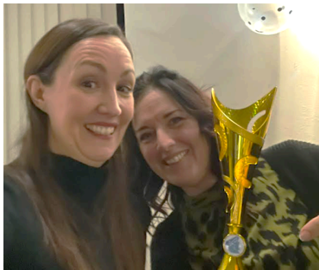
BGLC Wellbeing AWARD WINNERS!