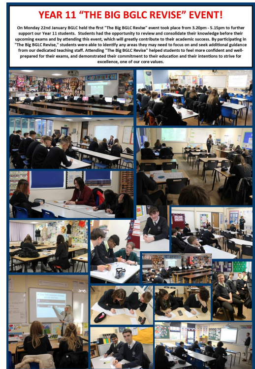
Year 11 THE BIG REVISE Event 22.1.24