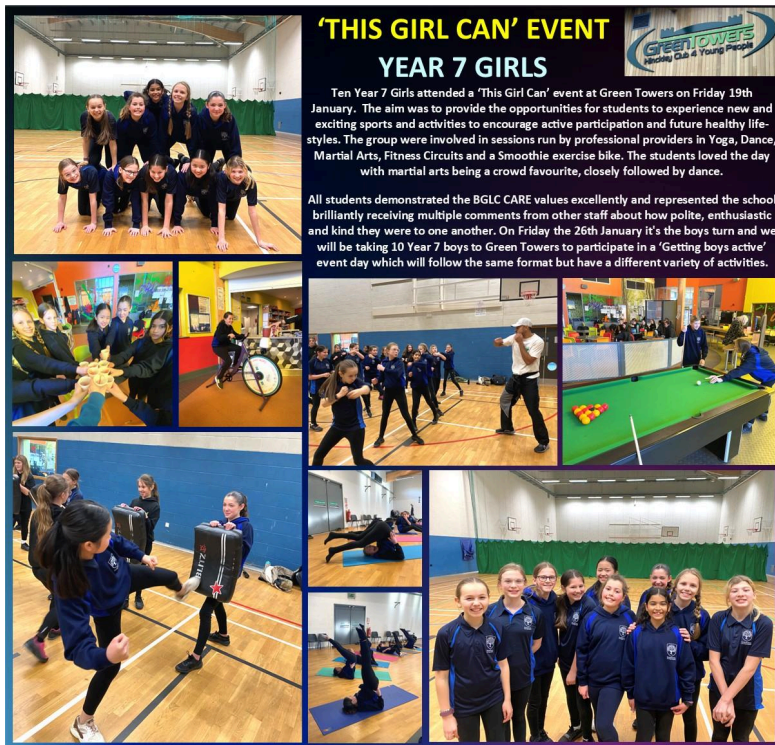
Year 7 'This Girl Can' Event 9.1.24