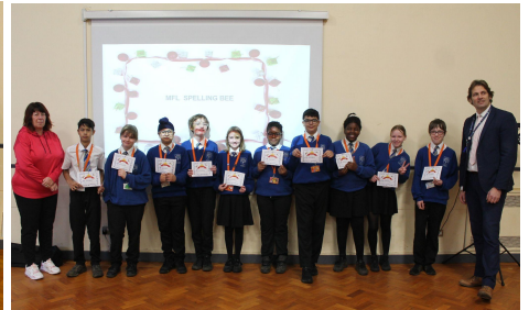
Year 7 Xmas Celebration Assembly 18.12.23