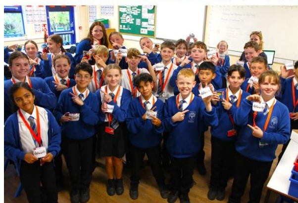
Halloween 31.10.23 - Year 7 were all awarded with Halloween treat bags!