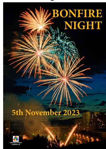
Bonfire night 5.11.23