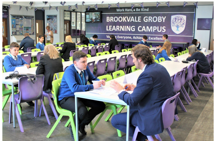
Year 9 PROUD STATIONS 25.4.23