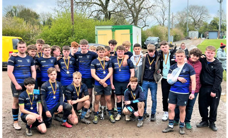
U16 LFRC County Cup finals, but unfortunately were defeated by Market Harborough 23.4.23