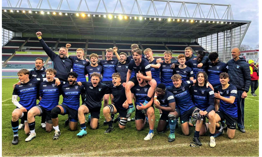
Colts Leicester Forest Rugby Club COUNTY CHAMPIONS 24.3.23!