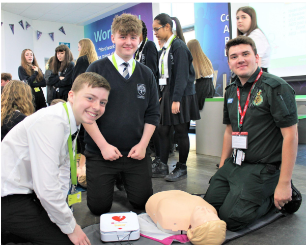
Year 10s CPR & AED training 25.4.23