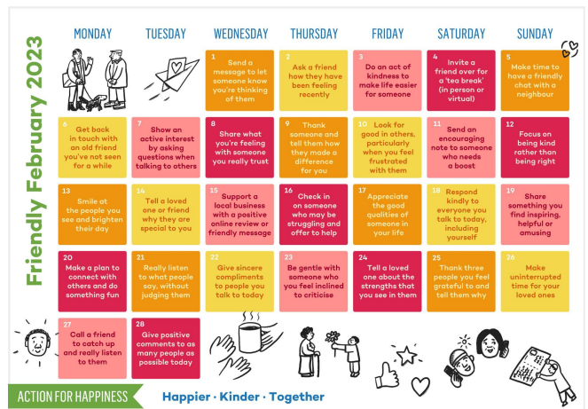
Action For Happiness Friendly February Calendar