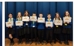
Year 7 Spelling Bee 31.1.23