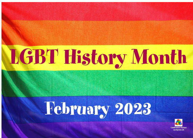
LGBT History Month