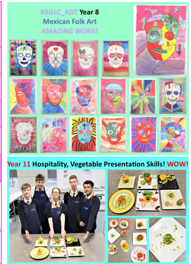
January 2023 Campus newsletter