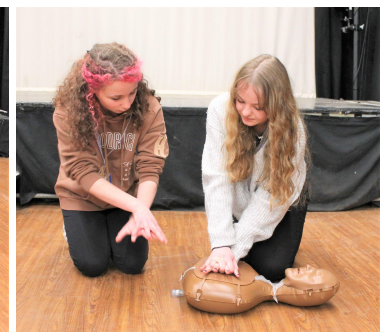
Year 12 students trained by British Red Cross 25.1.23