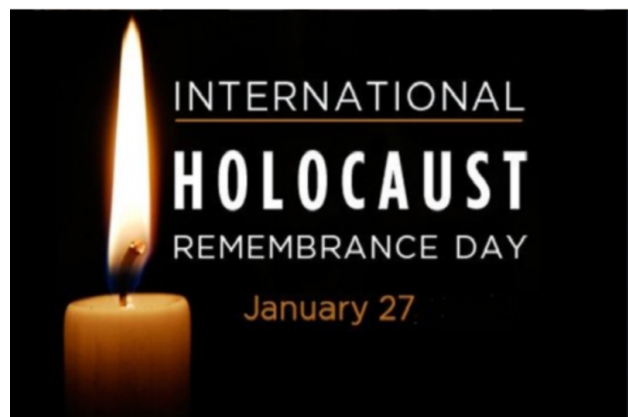
Holocaust Memorial Day 27.1.23

Celebration Posters https://www.brookvale.ac.uk