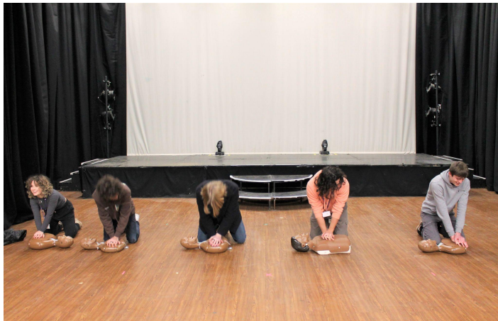
Year 13 students trained by British Red Cross 18.1.23