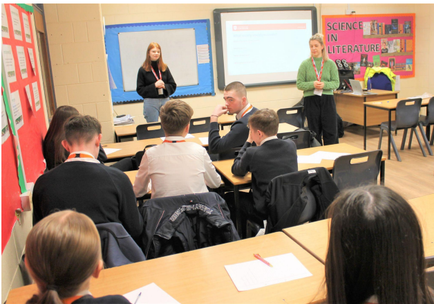
Year 11 University visit 18.1.23