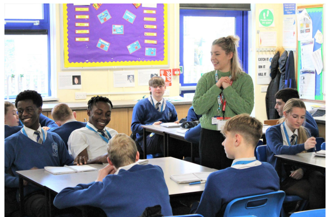
Year 9 University visit 18.1.23