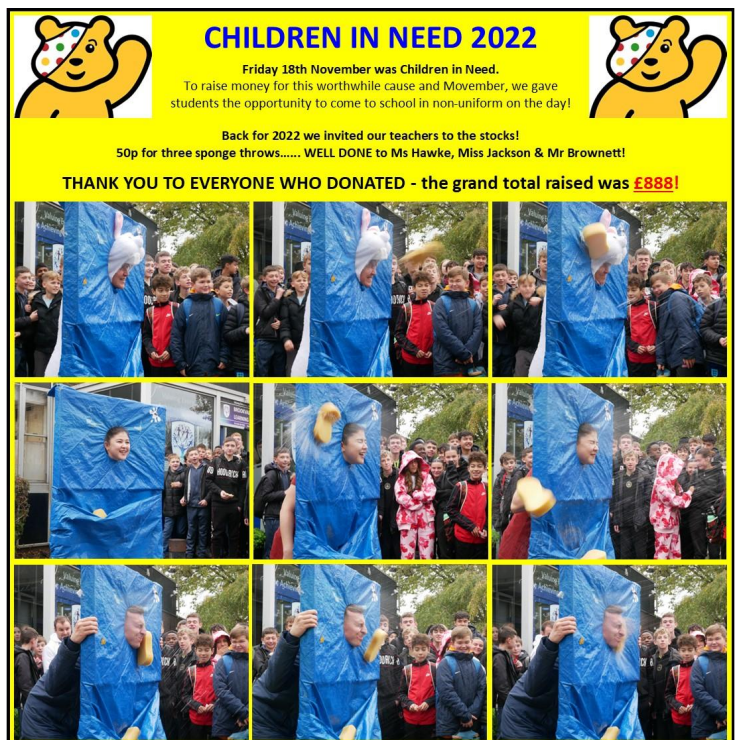
Children In Need 2022 raised £888!