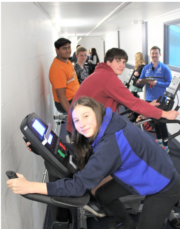
Movember 60K Challenge 21.11.22

'Numvember' WEEK 4 puzzle - win a £20 Amazon voucher