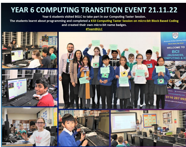
Year 6 BCI Transition Event 21.11.22