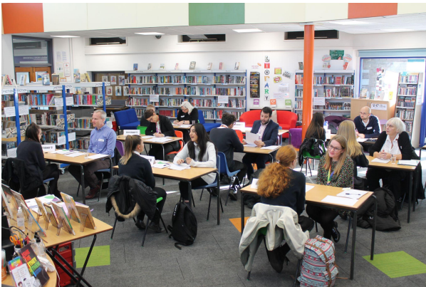
Year 11 Mock Interviews 9 & 10.11.22