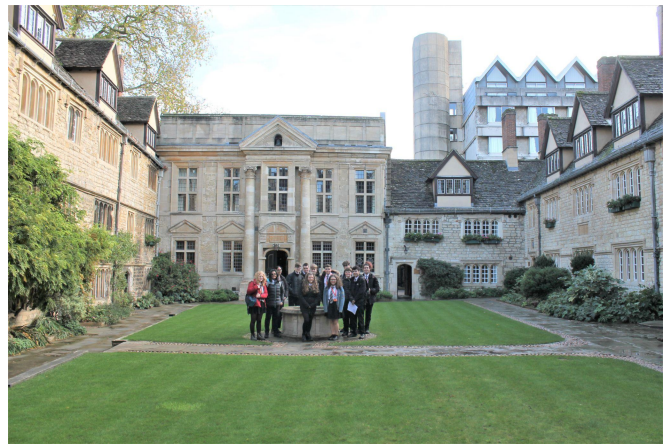
P16 Media Stop Motion Animations Workshop 7.11.22 Yr11 students visit to The University of Oxford 8.11.22