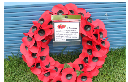
Remembrance Day 11.11.22