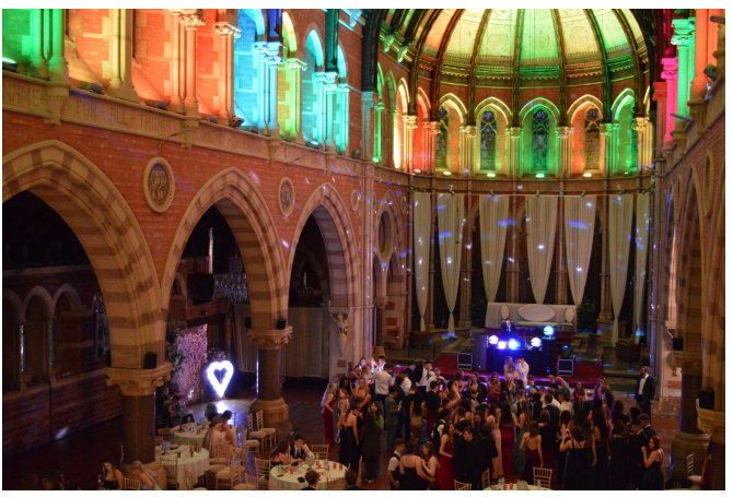
Year 11 Prom 6th July