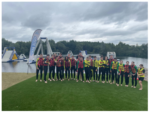
Year 12 Spring Lakes Watersports Trip 5th July