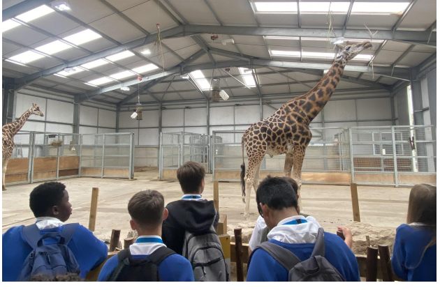
Year 8 Twycross Zoo trips 4th & 5th July