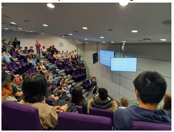
Year 12 Coventry University Experience 4th July