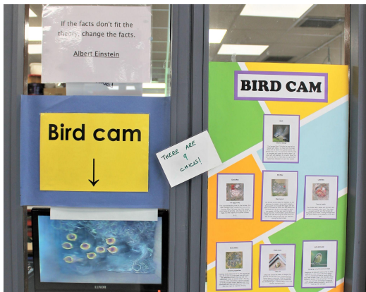
Science Bird Cam - 9 new babies!