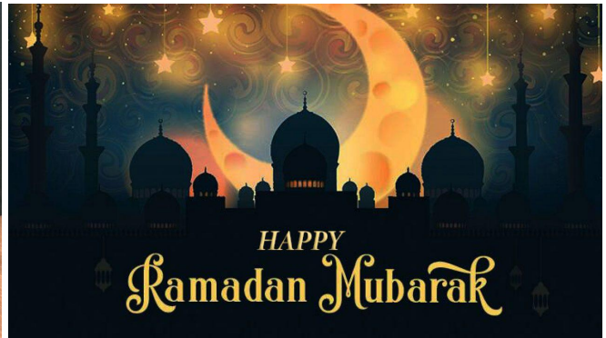
Ramadan 2nd April - 1st May