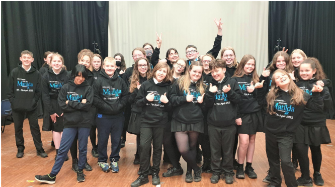
Matilda performance week!