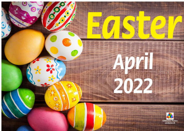
HAPPY EASTER 2022!