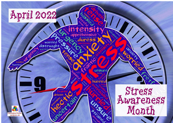
Stress Awareness Month