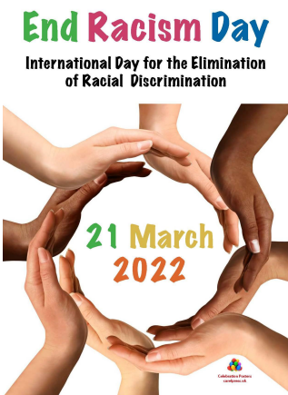
End Racism Day 21.3.22