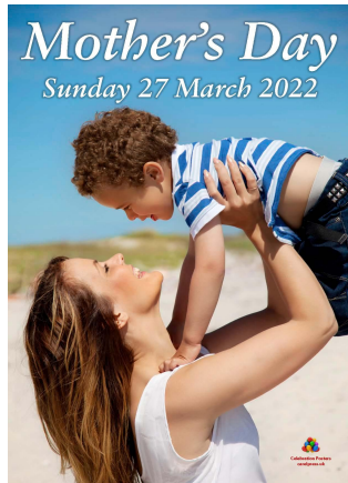
Mother's Day 27.3.22