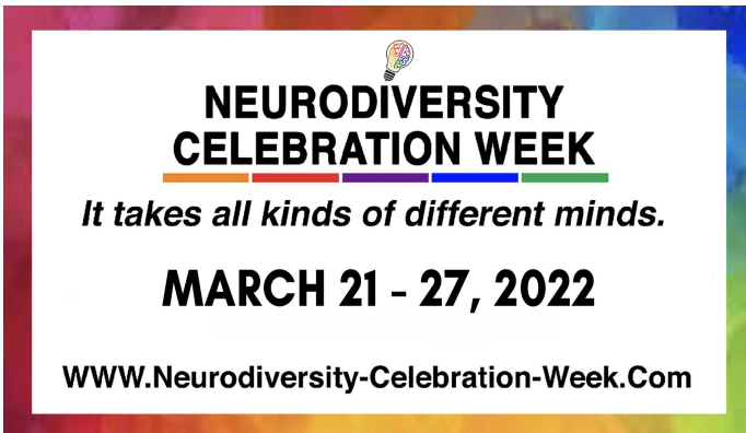
Neurodiversity Celebration Week 21 - 27 March