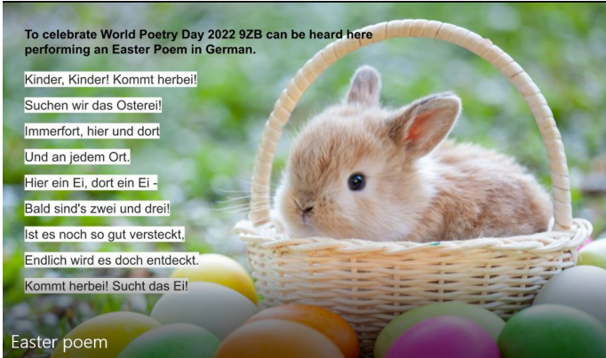
World Poetry Day 21.3.22