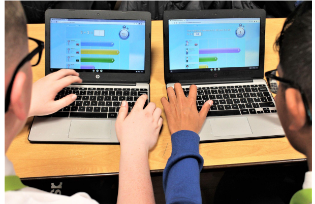
World Maths Day 23.3.22