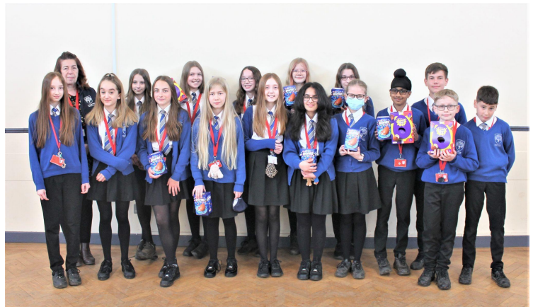
Year 7 MFL ART COMPETITION WINNERS