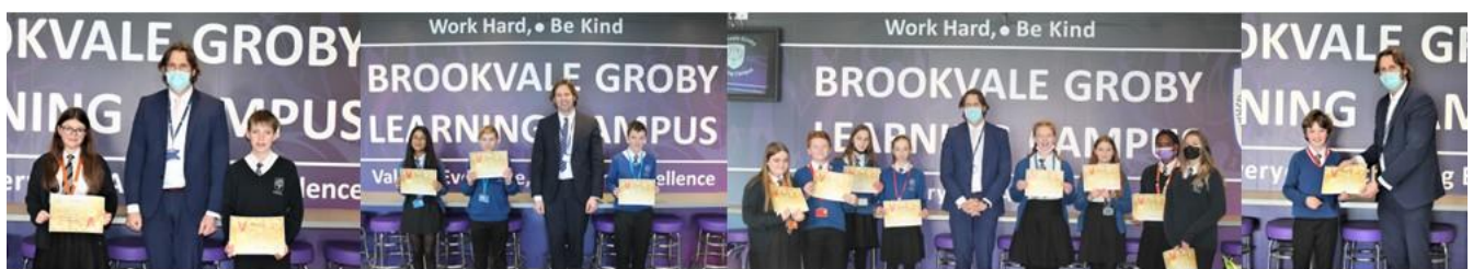
Headteacher's Awards - well done to our AMAZING students!