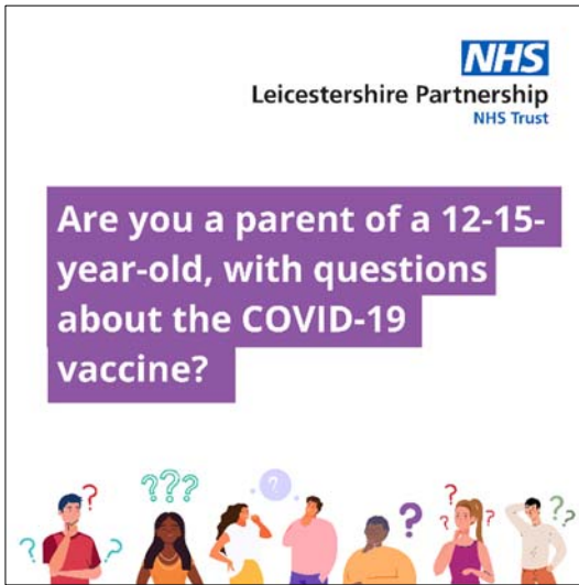
Graphic for parents