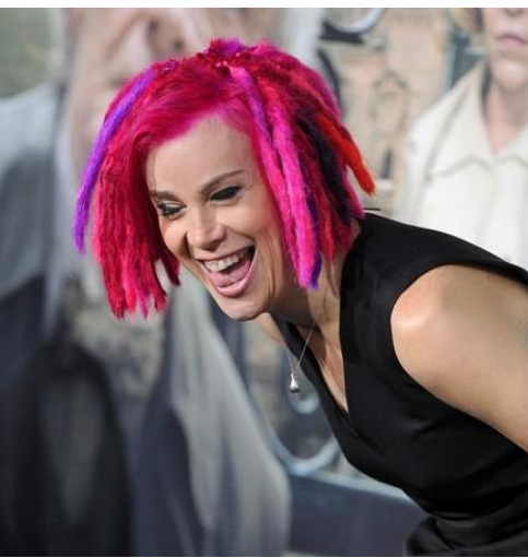
Lana Wachowski Film writer/director