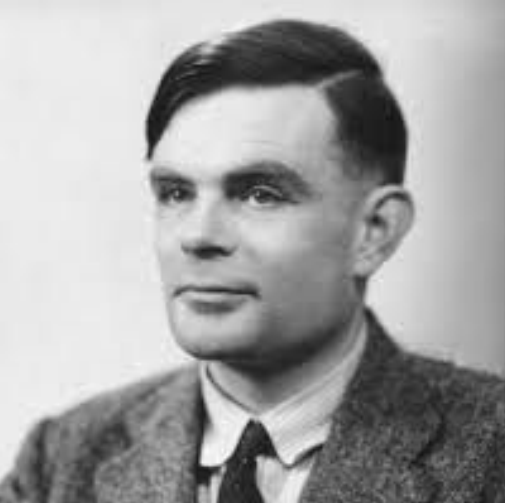
Alan Turing Wartime code breaker/ computing pioneer