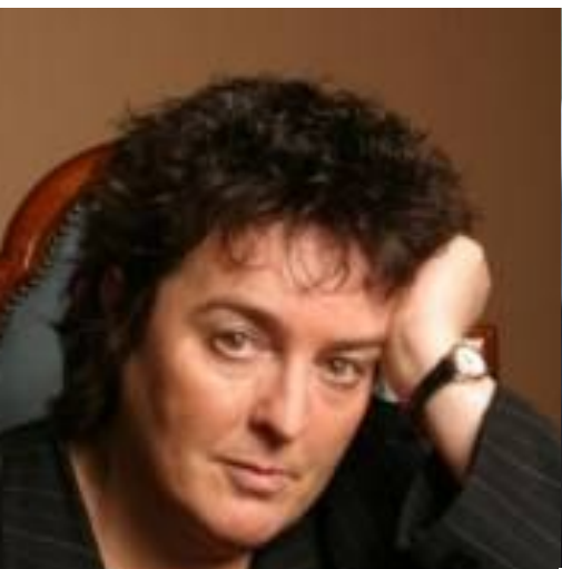
Carol Ann Duffy Poet