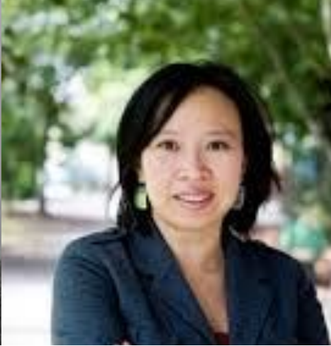
Malinda Lo Writer