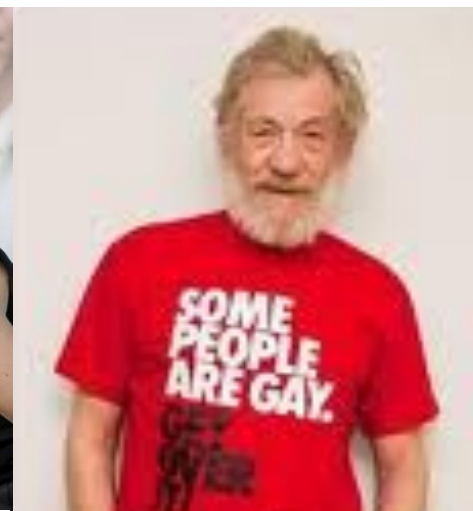
Sir Ian McKellen Actor