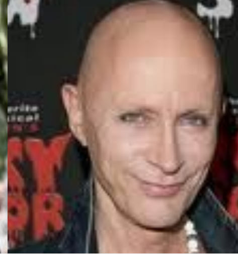
Richard O'Brien Writer/actor