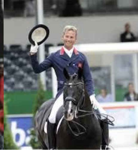
Carl Hester Olympic dressage rider