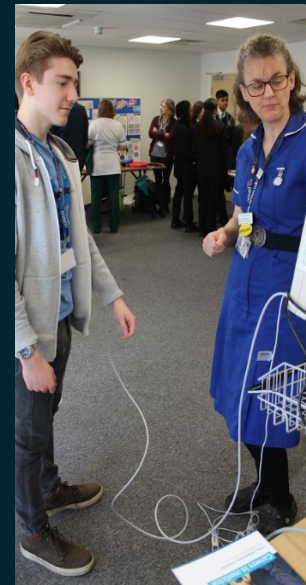
Highlights from 2019-2020