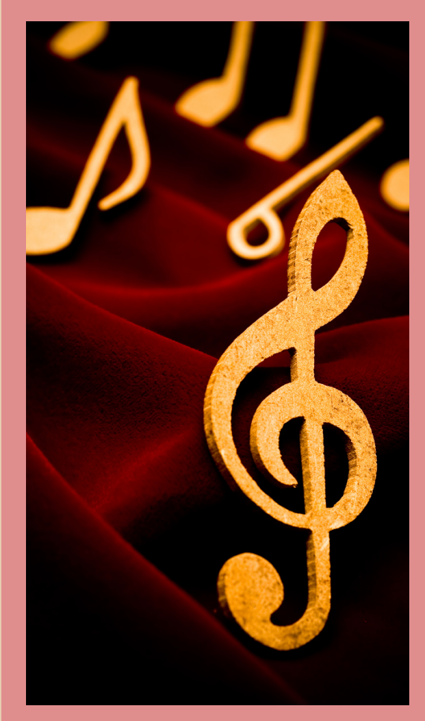
CLICK HERE TO FILL IN THE ONLINE ENSEMBLE APPLICATION E-FORM

"AS A PARENT, SO MANY OPPORTUNITIES TO WATCH AND FEEL SO VERY PROUD! THANKS TO ALL THE STAFF - IT WOULD NOT HAVE BEEN POSSIBLE WITHOUT YOU!"