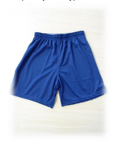
PE Shorts (Compulsory)