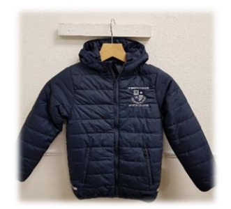
Padded Jacket (Compulsory)