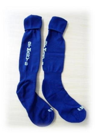
PE Socks (Compulsory)