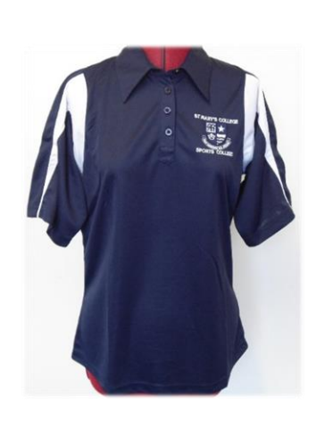
GIRLS' PE Haze Polo Shirt (Compulsory)