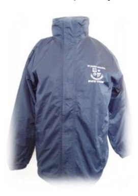
Reversible Coat (Compulsory)