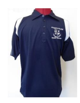
Boys Vapour Polo

Reversible Rugby jersey required for all outdoor PE lessons.