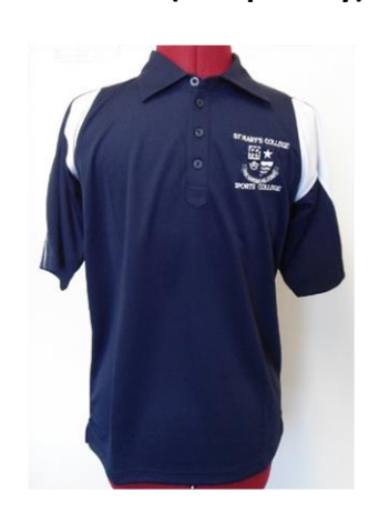
BOYS' PE Vapour Polo Shirt (Compulsory)