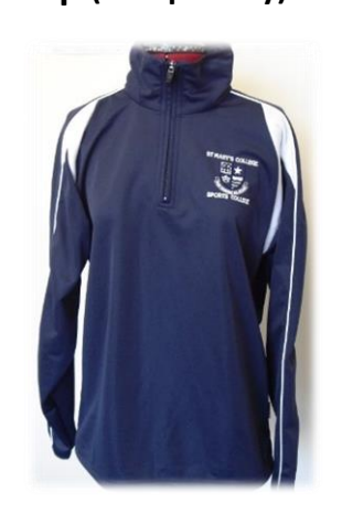
GIRLS' PE Cuatro Training Top (Compulsory)