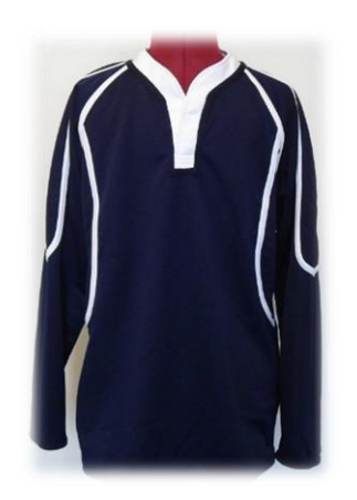
BOYS' Pro-Tec Rugby Shirt (Compulsory)