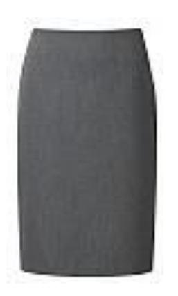
Girls Grey Skirt including Junior sizes (Compulsory)