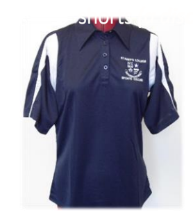
Girls Haze Polo

Required for <u>all outdoor</u> PE lessons.