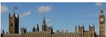
Big Ben and the Houses of Parliament