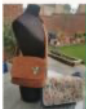
MAKE A HANDBAG