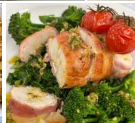
More delights from the Kitchen