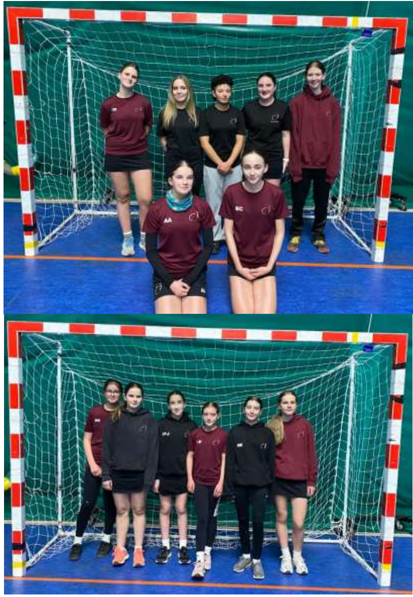
Well done girls for your resilience and great performance!

We played our first girls handball fixtures last week against a strong Westfield team. Despite losing, Ansford showed lots of promise and put the team under pressure, which they were not expecting!! We are now in training ready for fixtures after Christmas.