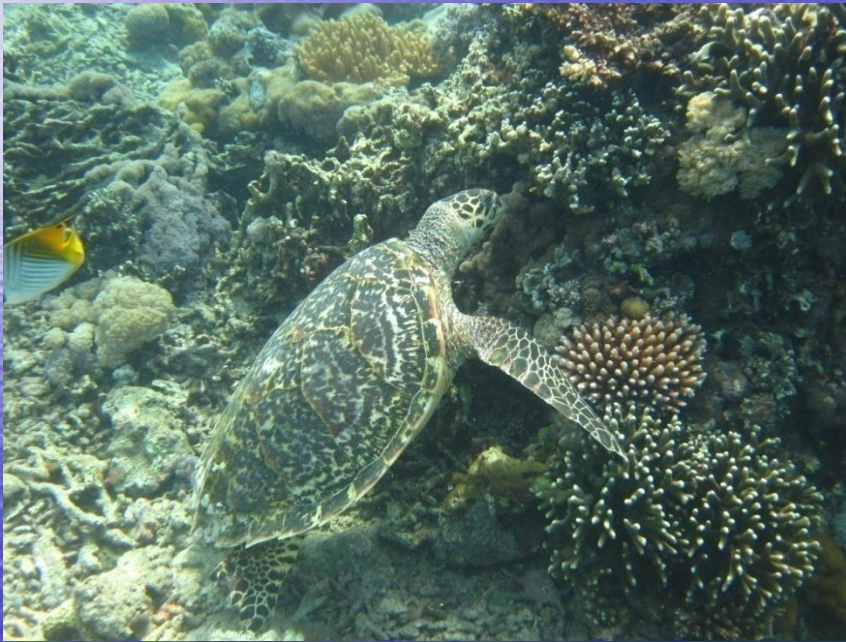
Hawks Bill turtle