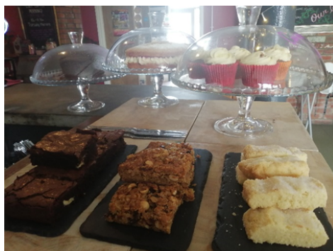
Cakes for sale baked by one of our students on placement!

Ansford would like to extend a huge thank you to all employers who supported work experience this year and acknowledge appreciation for their time and commitment in supporting the students in placements – without this the programme wouldn't be possible. Thanks also to all the parents who supported the process. Thank you all very much!