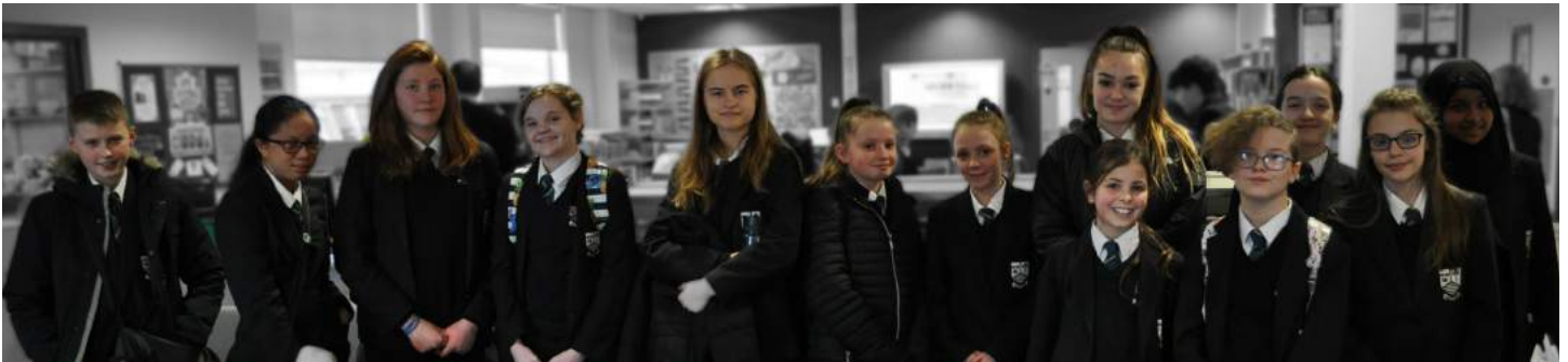
The students who entered the poetry competition