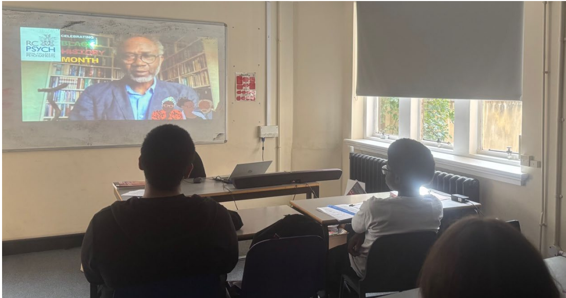
Psychology – A- level