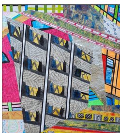
ALPERTON COMMUNITY SCHOOL VOICES FROM ALPERTON PRESENT Home - An Anthology 2021