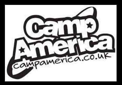
Camp America https://www.campamerica.co.uk/