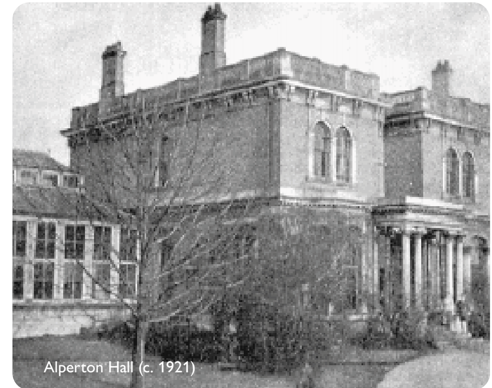
Alperton Hall (c. 1921)