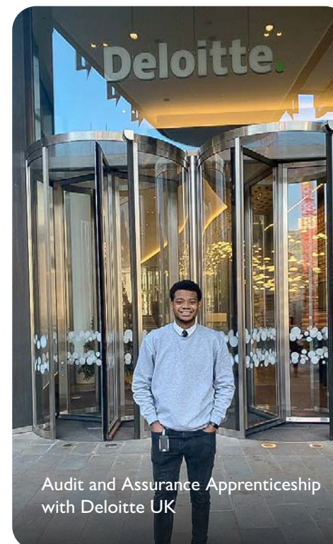
Audit and Assurance Apprenticeship with Deloitte UK