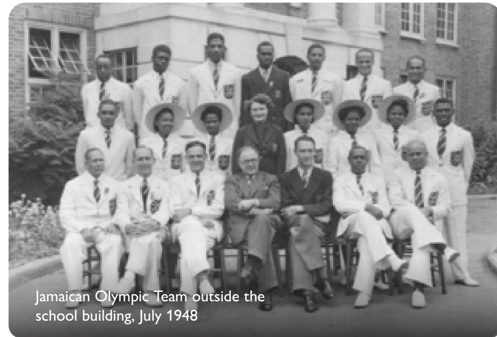
Jamaican Olympic Team outside the school building, July 1948

Throughout the years the school has had numerous successful students. Amongst others, the English football player Ron Greenwood, best known for managing the English national football team and West Ham United, the famous musician Keith Moon, the drummer of the English rock group The Who, and Nicholas "Nickie" Hopkins, a famous musician who recorded and performed on many notable British and American pop bands, including Rolling Stones.