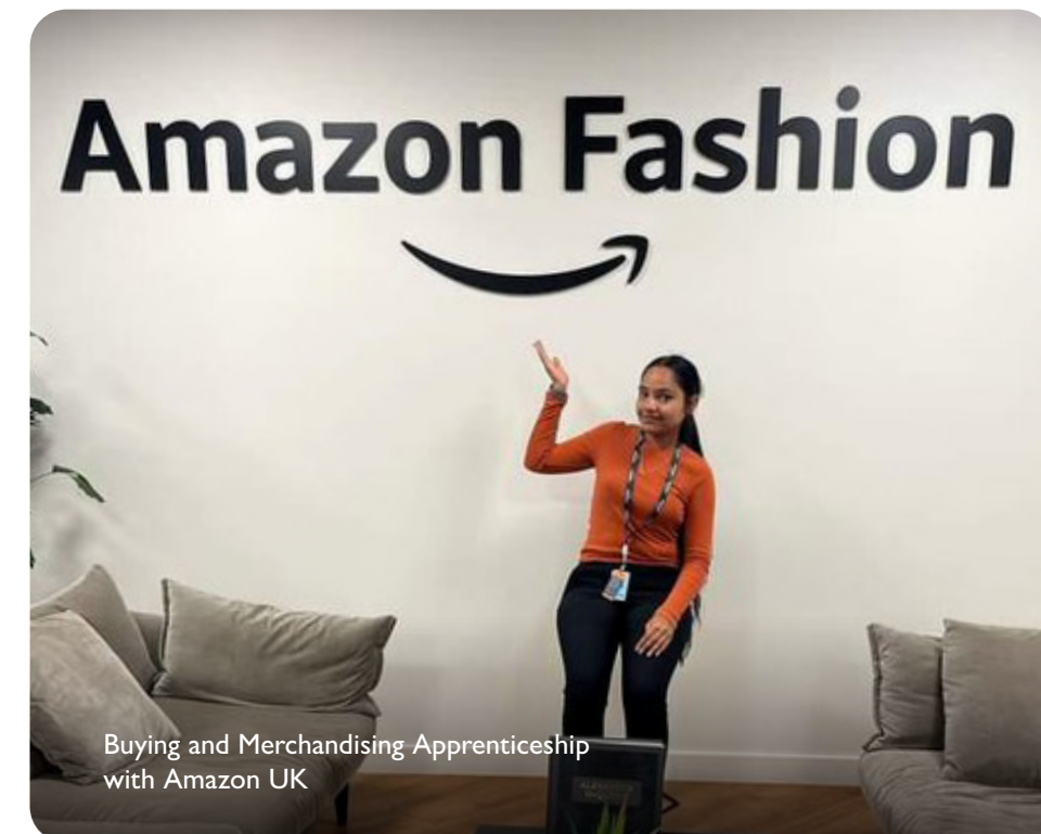
Buying and Merchandising Apprenticeship with Amazon UK