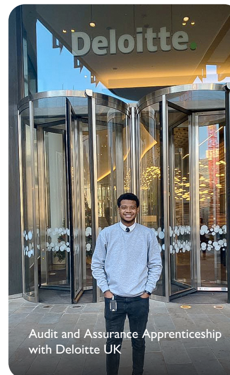
Audit and Assurance Apprenticeship with Deloitte UK