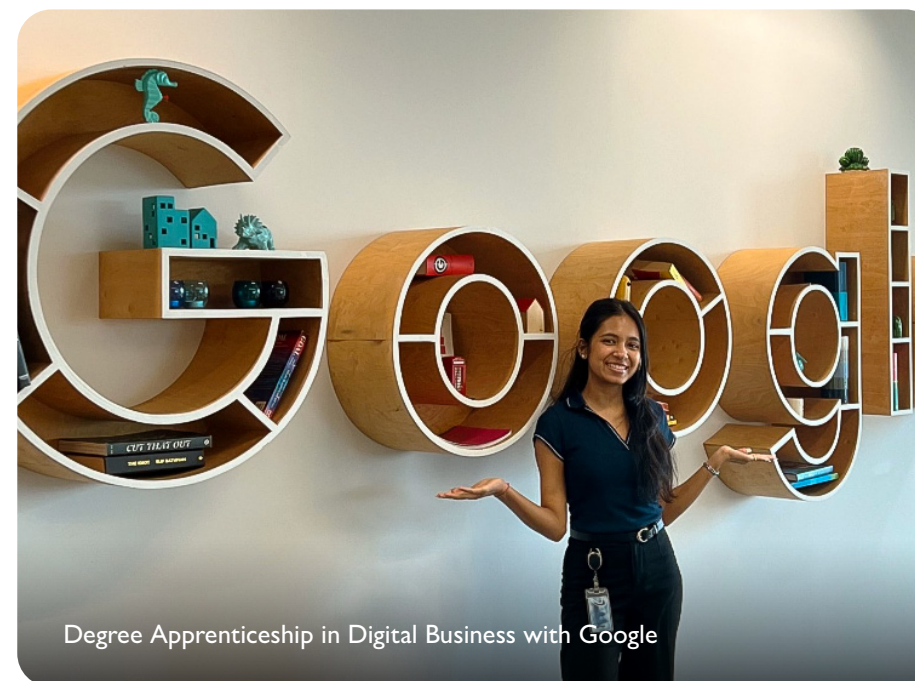
Degree Apprenticeship in Digital Business with Google