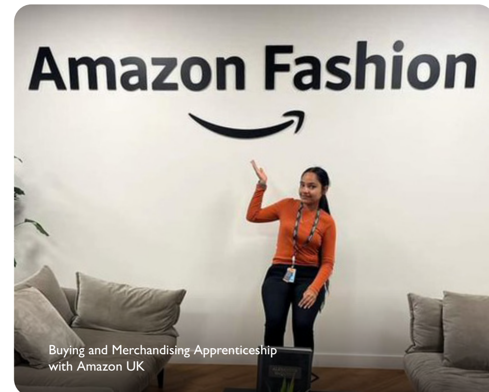
Buying and Merchandising Apprenticeship with Amazon UK