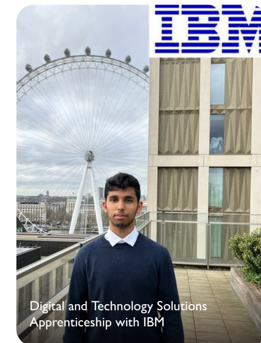
Digital and Technology Solutions Apprenticeship with IBM