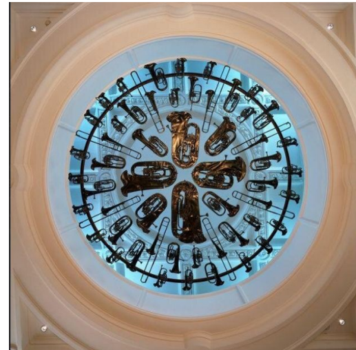
Breathless, Sculptural Installation, 2001 (made)