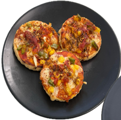
Poonam 9Y Bhagyashri 9Y