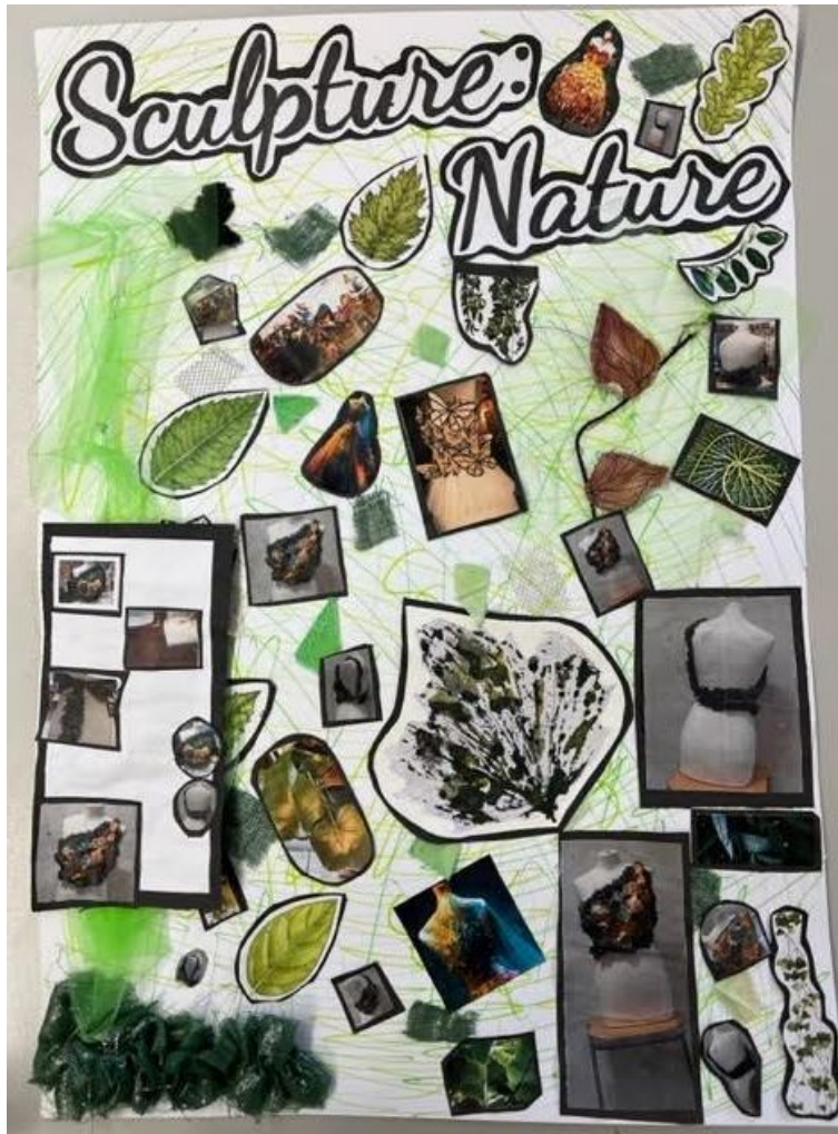
Year 12: Sculptural fashion project