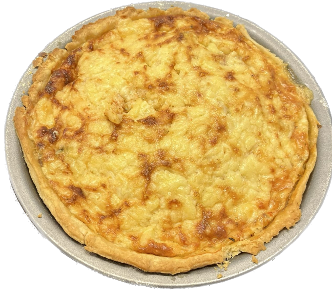
Mobeen 10L & Caeden 10N