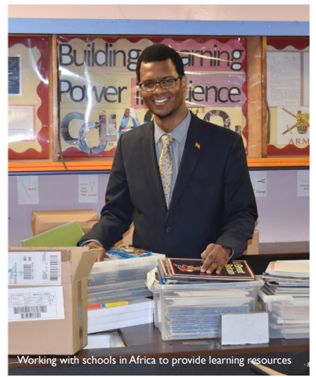
Working with schools in Africa to provide learning resources