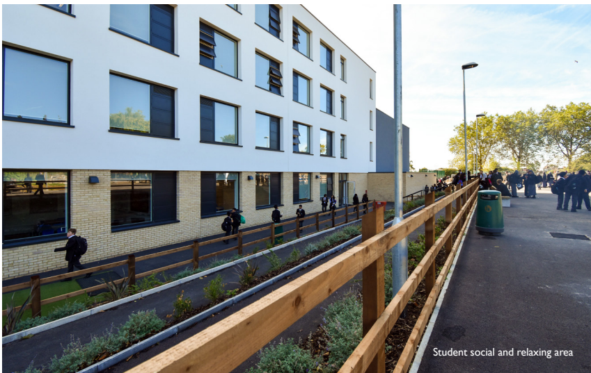
Student social and relaxing area