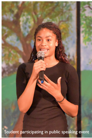
Student participating in public speaking event