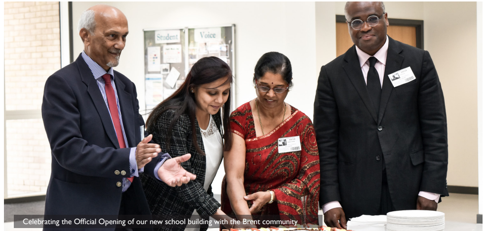
Celebrating the Official Opening of our new school building with the Brent community