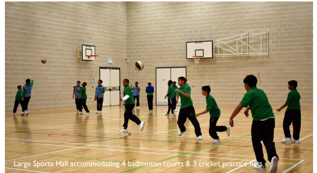
Large Sports Hall accommodating 4 badminton courts & 3 cricket practice nets