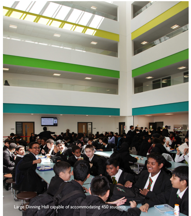
Large Dining Hall capable of accommodating 450 students