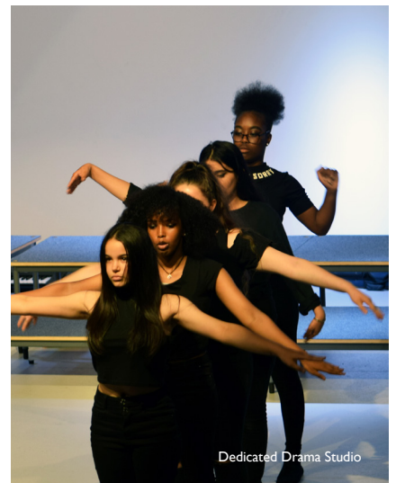
Dedicated Drama Studio