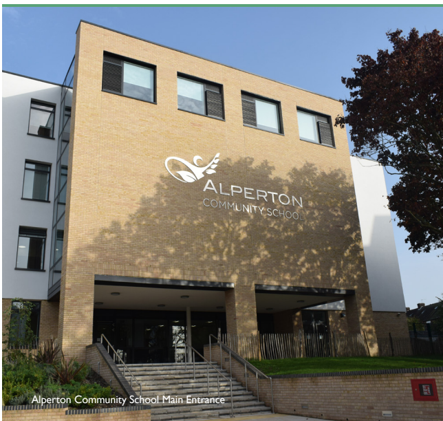
Alperton Community School Main Entrance