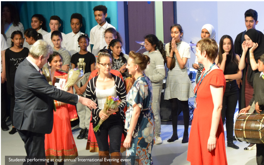
Students performing at our annual International Evening event