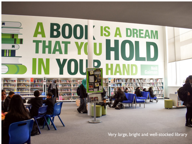
Very large, bright and well-stocked library