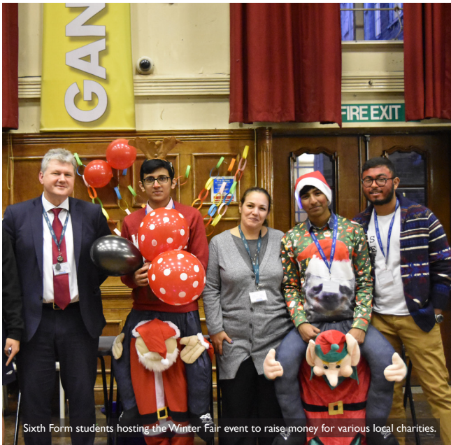
Sixth Form students hosting the Winter Fair event to raise money for various local charities.