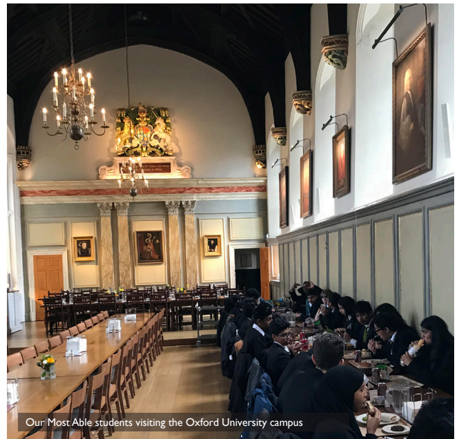
Our Most Able students visiting the Oxford University campus