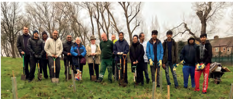
Photo: Alperton students with volunteers from Brent Council and Veolia at One Tree Hill Park

This weekend, four Alperton students braved the Saturday afternoon rain to get involved in the London's biggest event of mass tree-planting, sponsored by the Mayor of London, Sadiq Khan. The scheme had a workforce of 15,000 volunteers who worked towards planting a combined 80,000 trees across the capital to help London become the world's first 'national park city'.