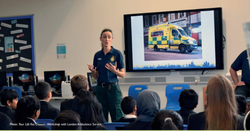
Photo: Your Life You Choose - Workshop with London Ambulance Service