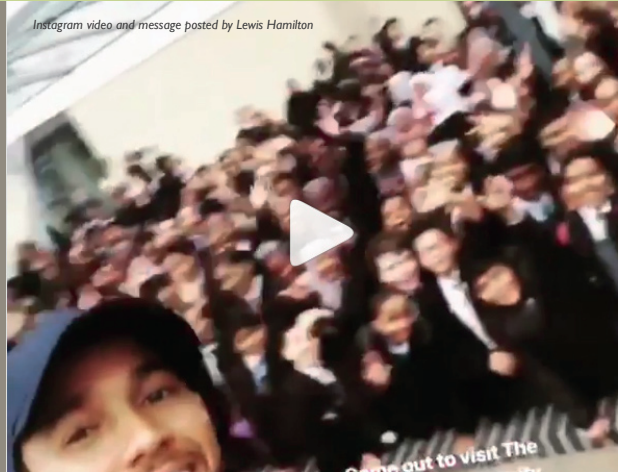
Instagram video and message posted by Lewis Hamilton

“Still buzzing from the love and energy from the kids at Alperton Community School today. So grateful for you having me. Keep working hard guys, stay focused on your goals. The struggle you are facing individually will make you stronger I promise you”.