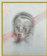
YEMİSİ - Y9