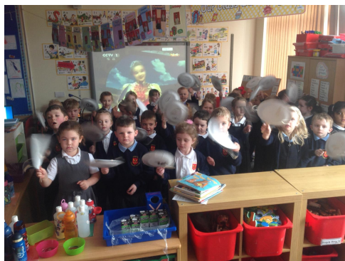
Reception children made Chinese drums and joined in playing along with a video

Watch out for more photos of International Week in our next newsletter, after half term.