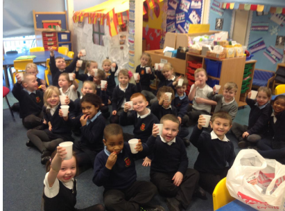
Sangria in Year 1 (Non alcoholic!!!)

Once again, our International Week has been a huge success, with the children learning about different countries and cultures around the world. Here are a few photos capturing a snapshot of the week.