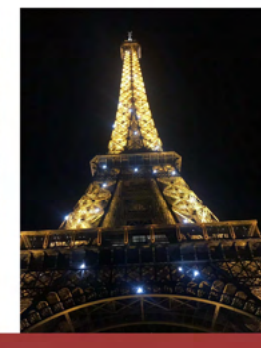
WHY BOOK WITH ME? 10% of all commission goes towards your PTA fund - Simple as that