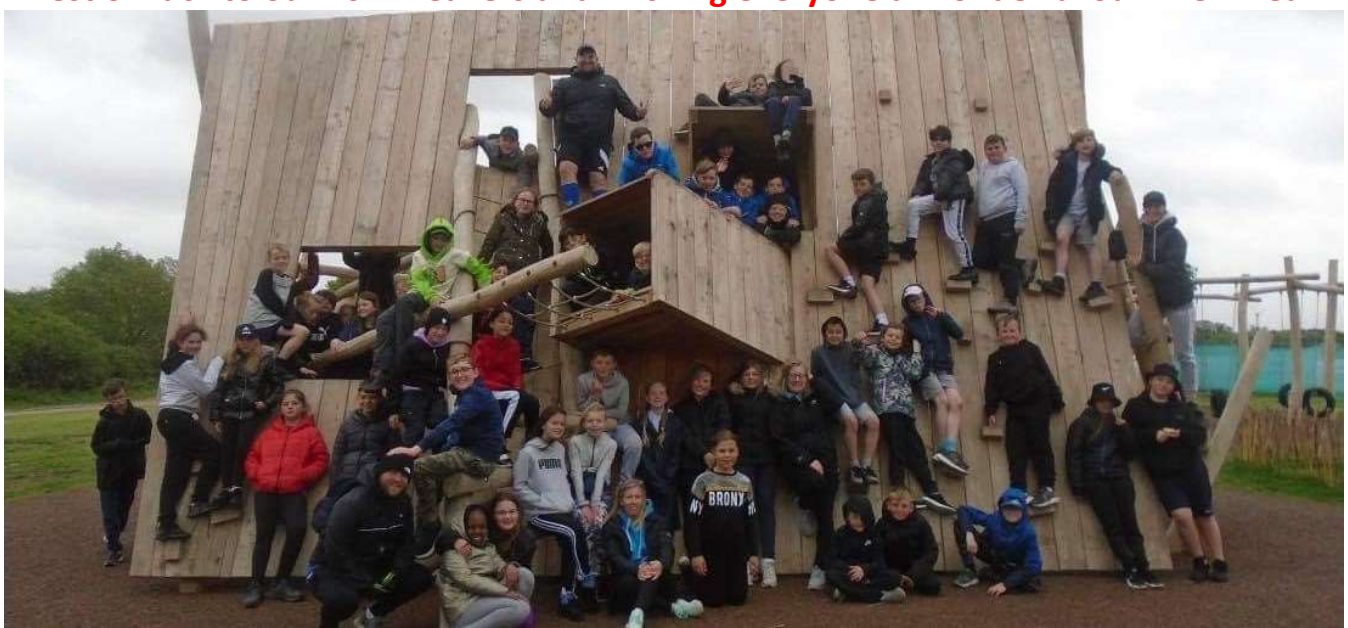
GJP Class of 2021