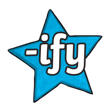
to create a verb

A suffix is added to the end of a word to make a new word.