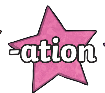
an action or process