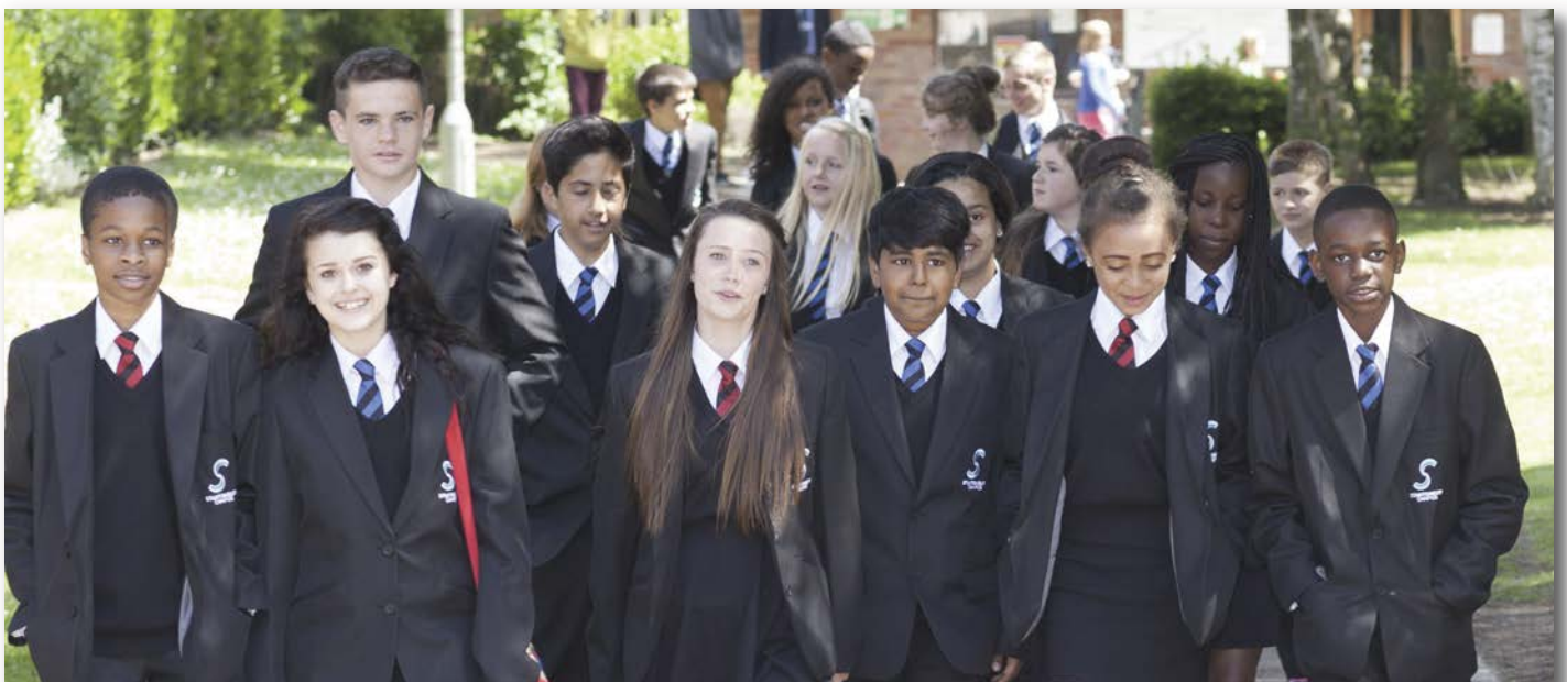
• Students from Stantonbury Campus