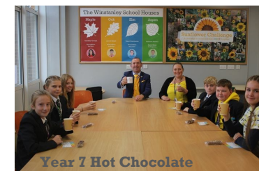
Year 7 Hot Chocolate