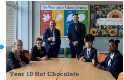
Year 10 Hot Chocolate