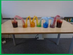
Science Week 2018— Year 3 Experiment