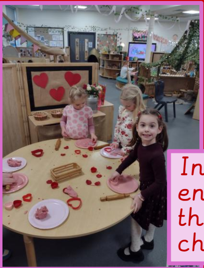
In the playdough area, they enjoyed pretending to make their own boxes of chocolates.