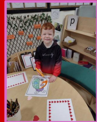
The children made beautiful cards for someone special at home.