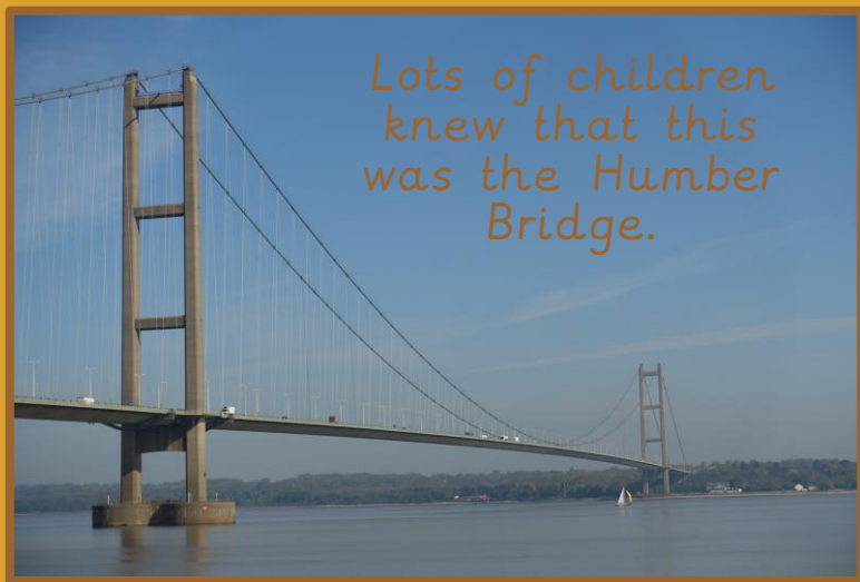
Lots of children knew that this was the Humber Bridge.