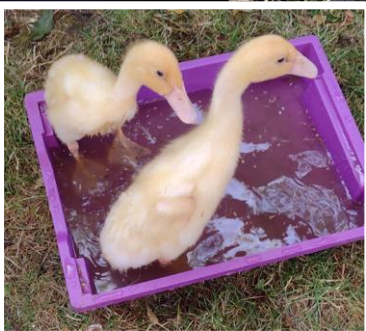
The real duckling was very cute and soft.