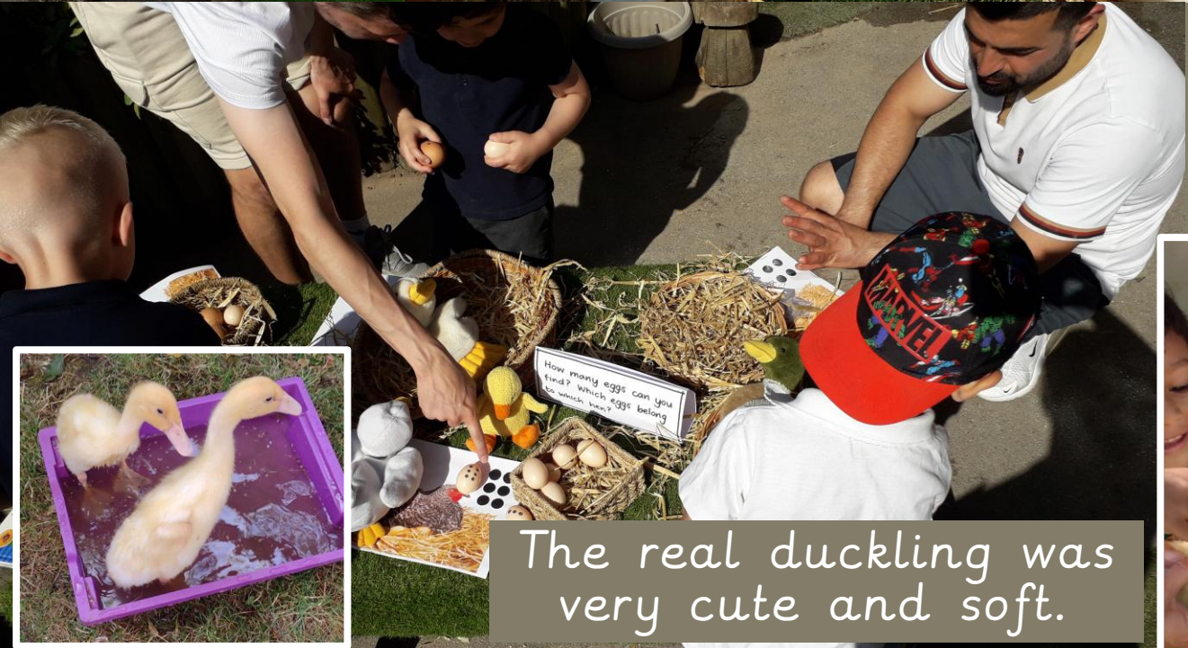
The ducks and hens needed help to sort out their eggs.