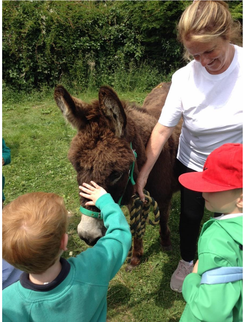
And a little cuddle and stroke of course!