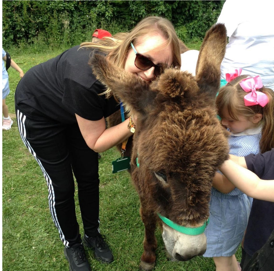
Donkey meet and greet!