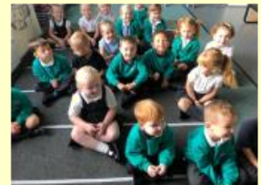
You started school Less than a year ago