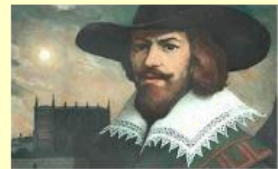
Guy Fawkes gunpowder plot 400 years ago