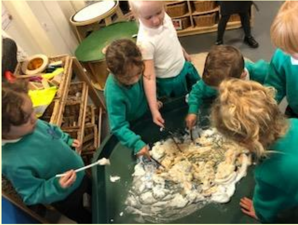
These children are making firework patterns in the shaving foam. Excellent mark making.

We loved doing the bonfire night activities around the classroom.