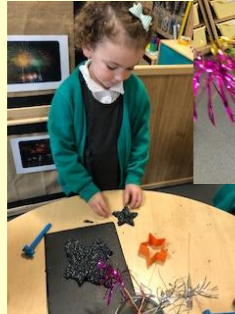
Look, some playdough fireworks.