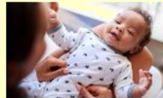
You were born 4 years ago