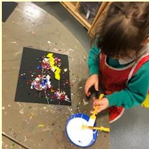
This is a fabulous fire work picture