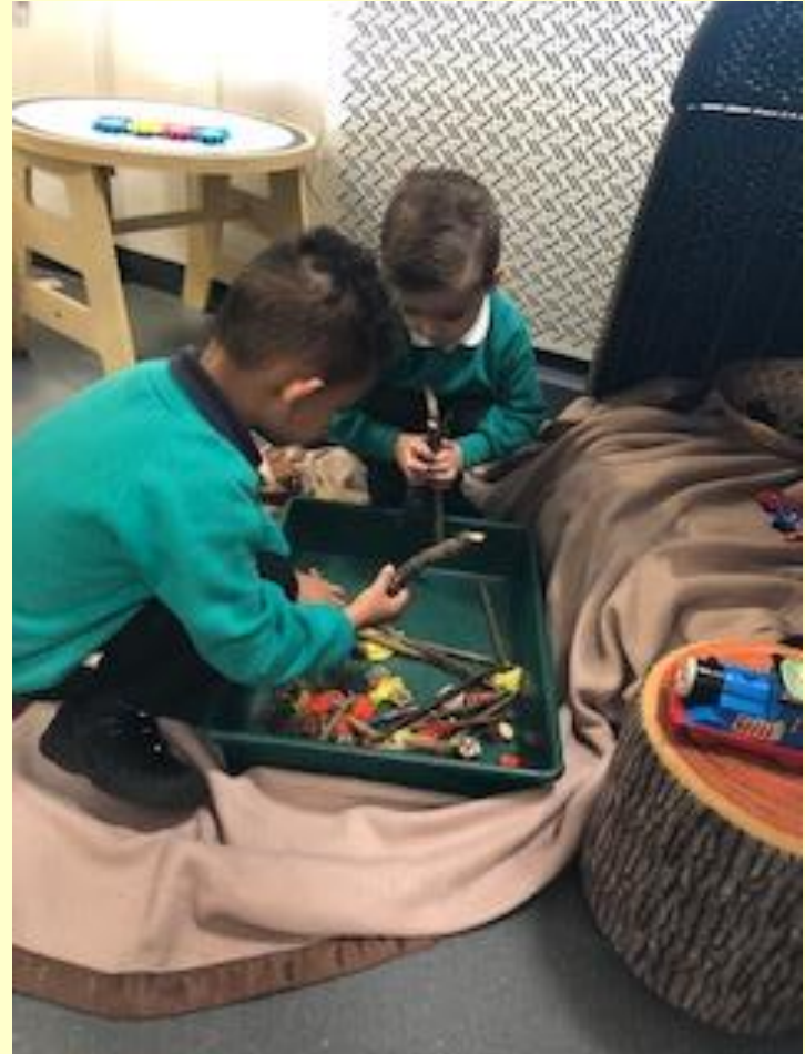
These boys are making their own bonfire.