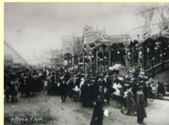
Hull Fair started 300 years ago