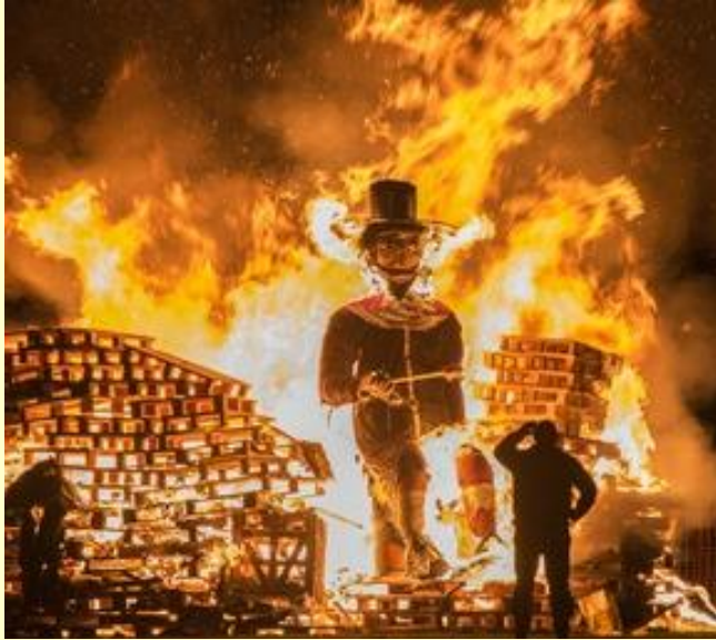
Here is a bonfire with a guy on it

We know why people celebrate bonfire night. And we know the story of Guy Fawkes is real .